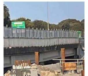
Cam River Bridge

"It's a long wait, my husband works in Wynyard and we live in Acton he left here at 6.30am and just got