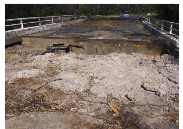
Saxon Creek Bridge at Frankford Rd is closed due to flood damage.

Authorised by the University of Tasmania, Hobart.